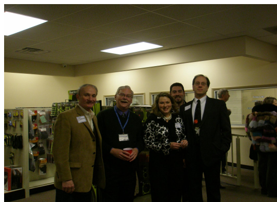
February Business Card Exchange at Pocono Pistol Club.